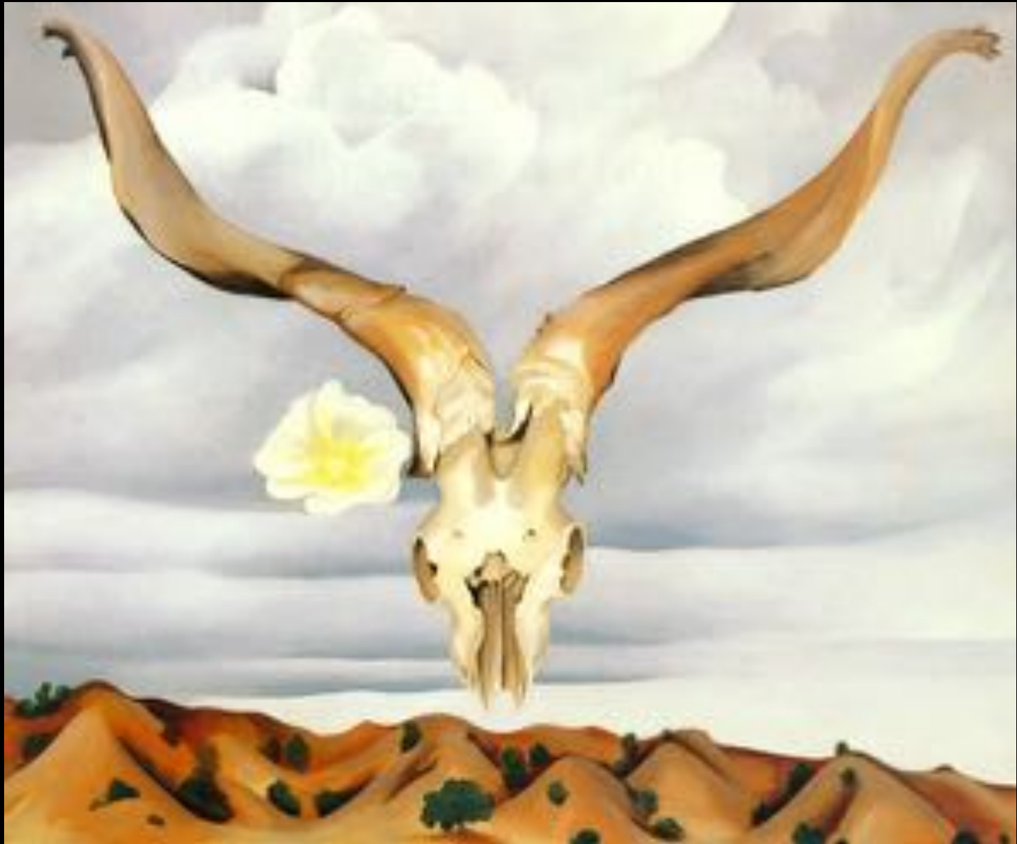
Georgia O'Keefe, Ram's Head, White Hollyhock and Little Hills , 1935.