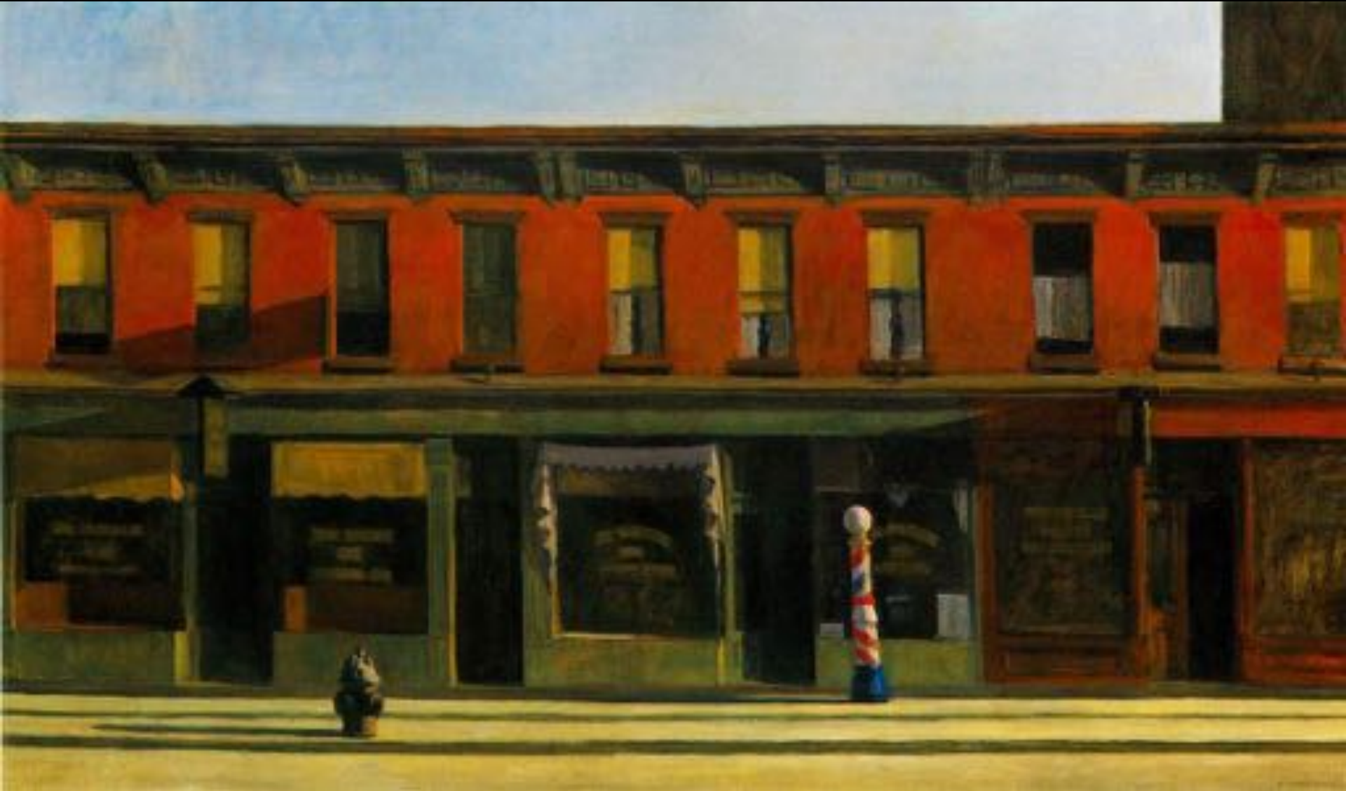
Edward Hopper, Early Sunday Morning , 1930.