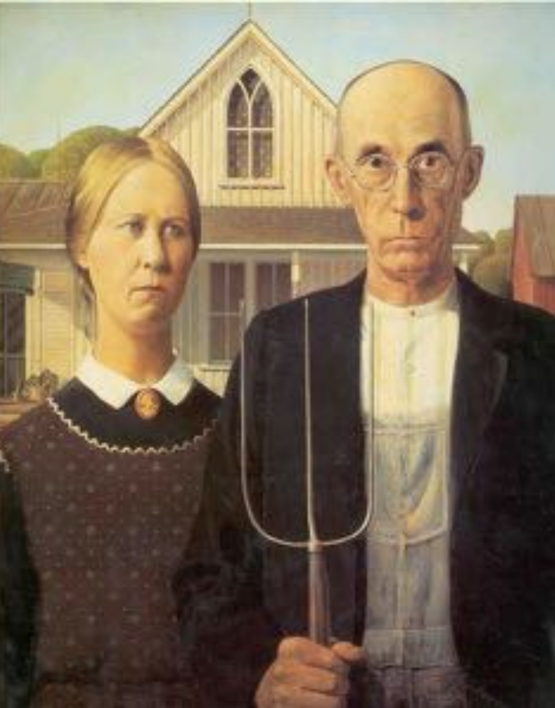
*Grant Wood American Gothic 1930.