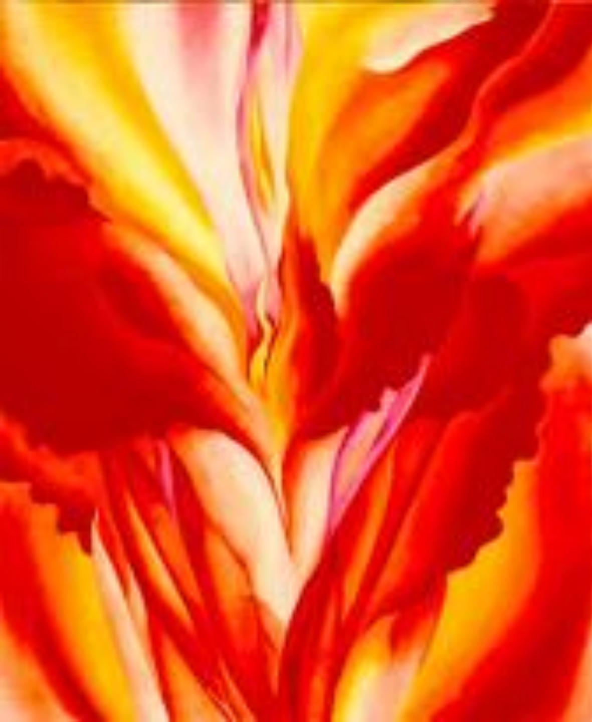
*Georgia O' Keefe Red Canna 1923