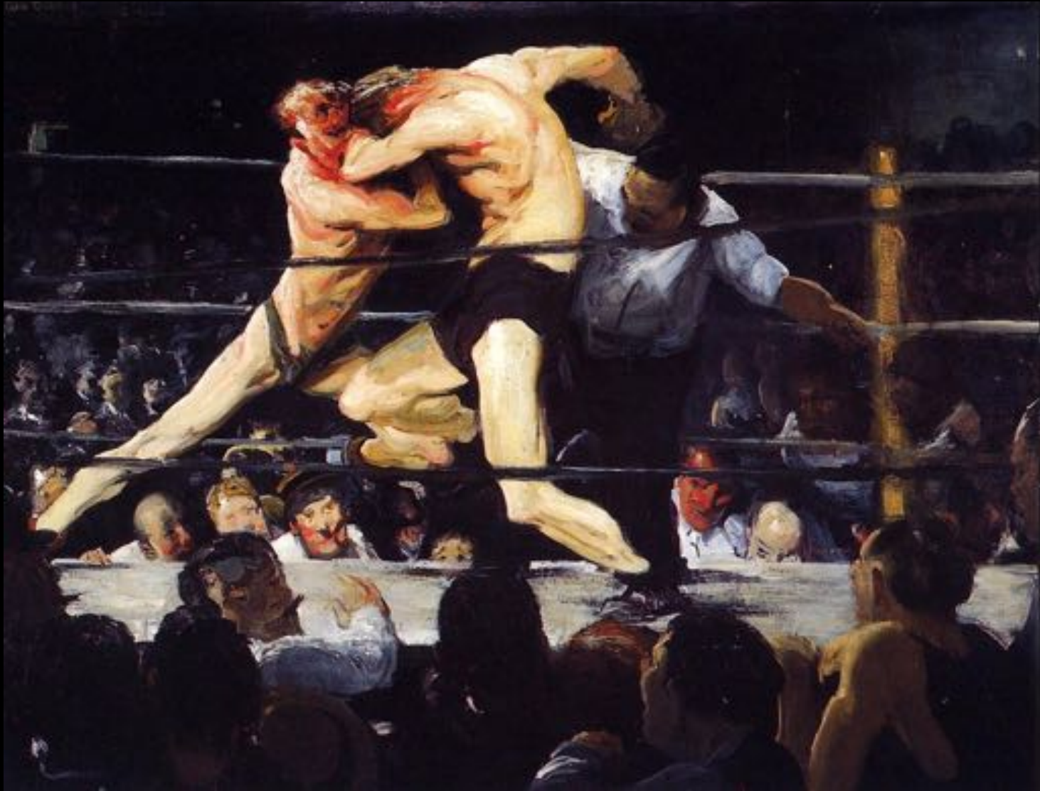
George Wesley Bellows, Stag at Sharkey's, 1909