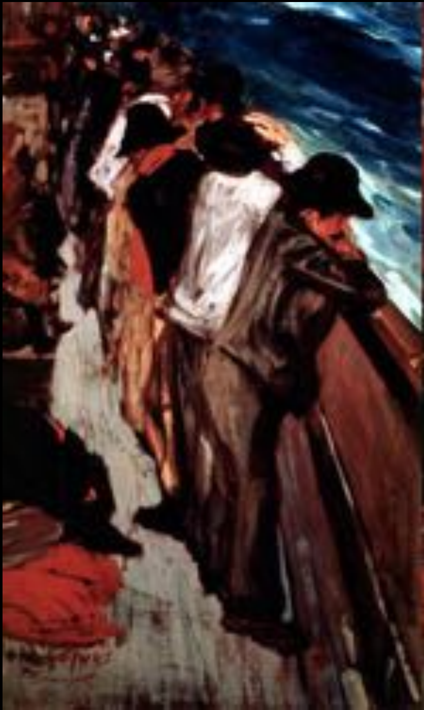
*George Benjamin Luks, In the Steerage , 1900